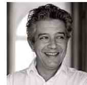
弗朗西斯科·艾利斯·马特乌斯 Francisco Aires Mateus

B.1968, Henan, China PHD., Tsinghua University Vice President, Deputy Chief Architect, Architectural Design and Research Institute of Tsinghua University